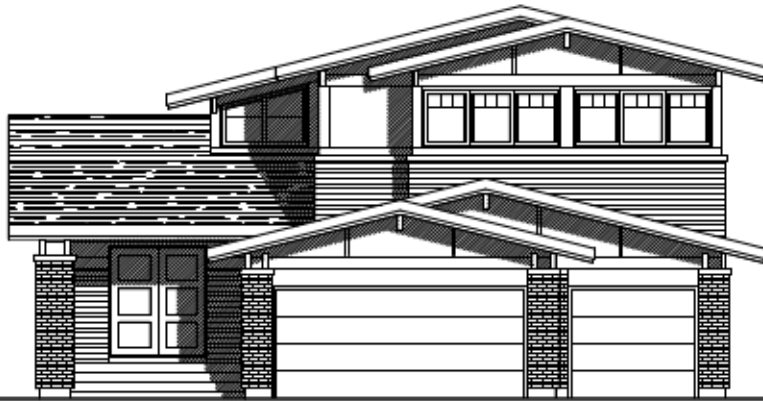
MID-CENTURY MODERN STYLE