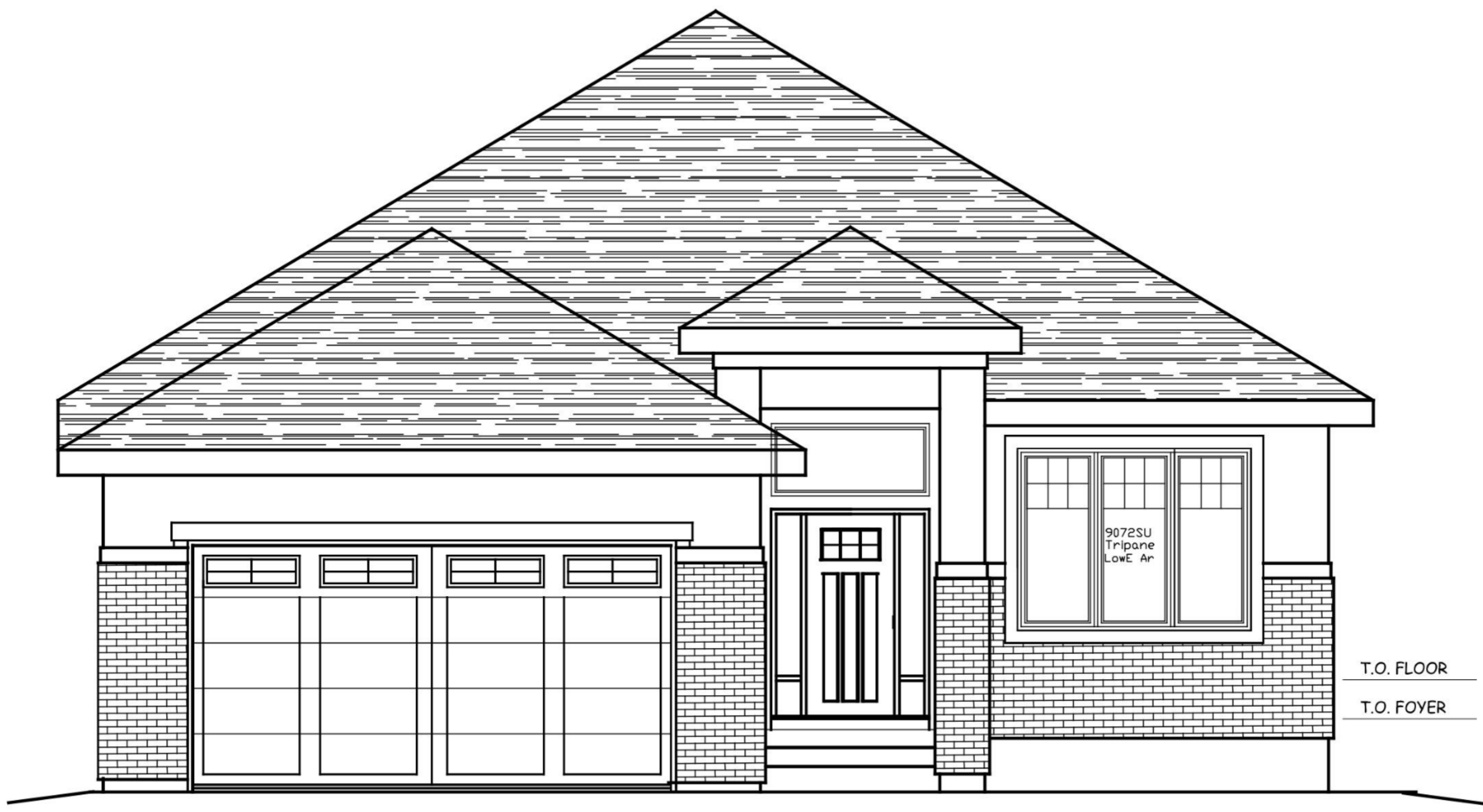
FRONT ELEVATION 3/16"=1'-0"